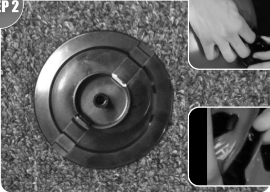
1-Balloon Adapter Clip