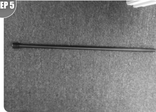
1-35" Aluminum Pole

5. Twist and lock Balloon Holder into top of pole.